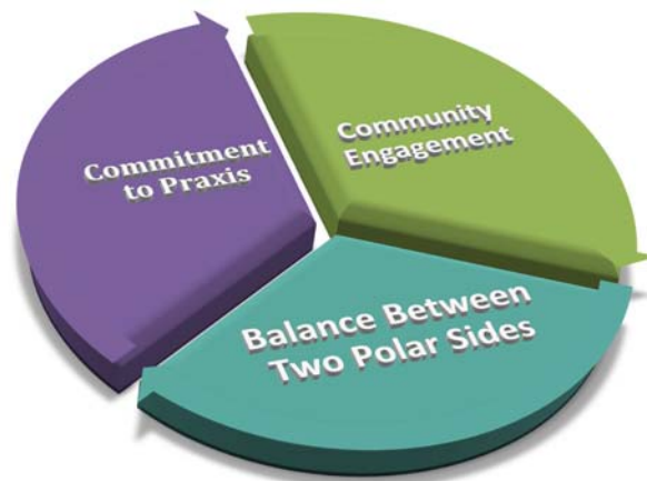
Figure 1: Components of best practice

administrative challenge, but it is a one that the administrators and policy makers have to do extensively and transparently. Therefore, it is important that the institutions set up a bridge between aspects of market rationales and educational-academic rationales in order to reach all their goals and objectives of international activities on and off campus.