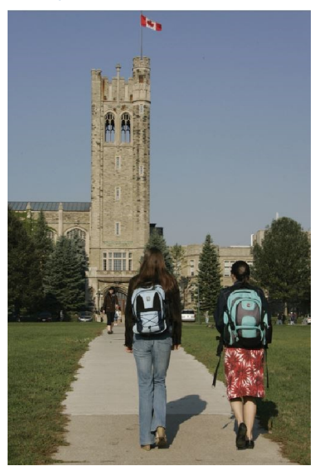
* Subject to Change

For more information, please visit International Student and Exchange Centre - UHIP page (<a href="http://www.uwo.ca/">http://www.uwo.ca/</a> international/iesc/current/health care in canada/uhip/index.html) or University Health Insurance Plan website (<a href="http://www.uhip.ca">http://www.uhip.ca</a>).