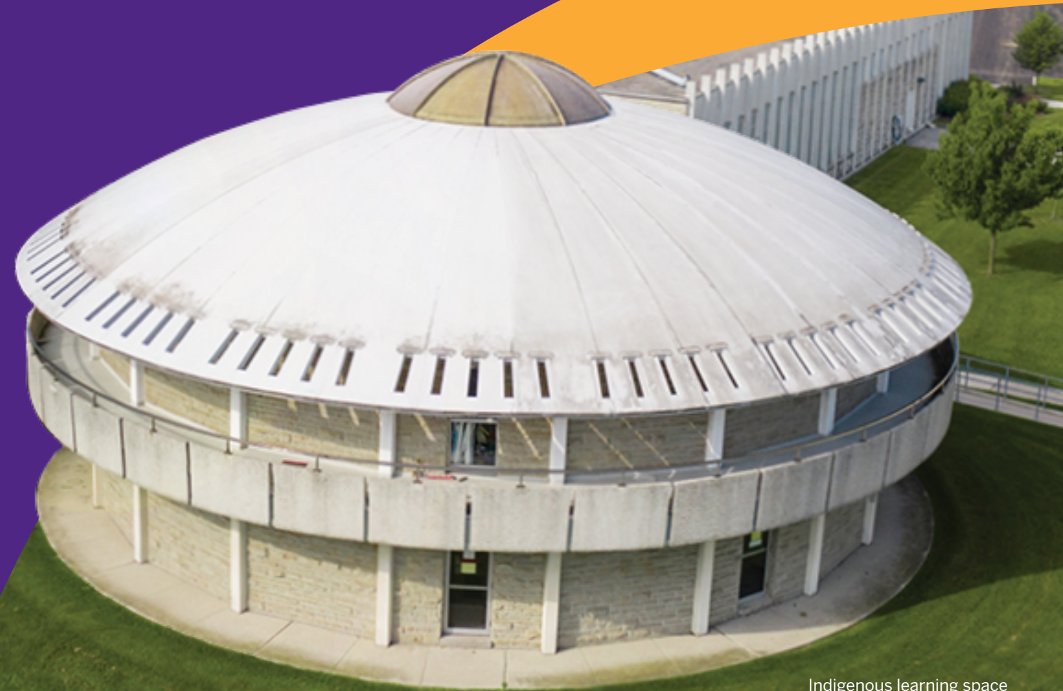
Indigenous learning space